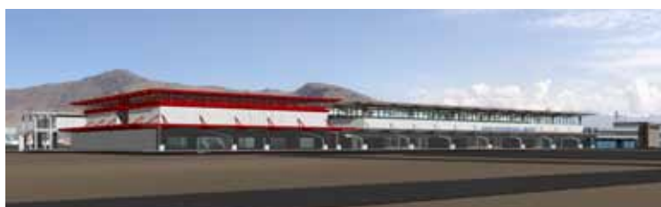
Proposed Expansion Terminal Building