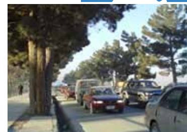
Traffic Congestion between Checkpoints