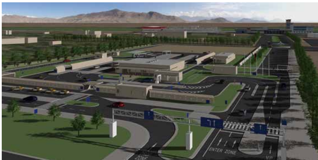
Proposed Airport Access Security Center