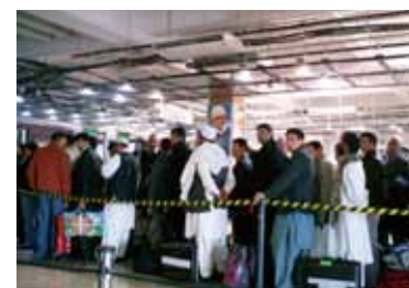
Queue for Security Gate